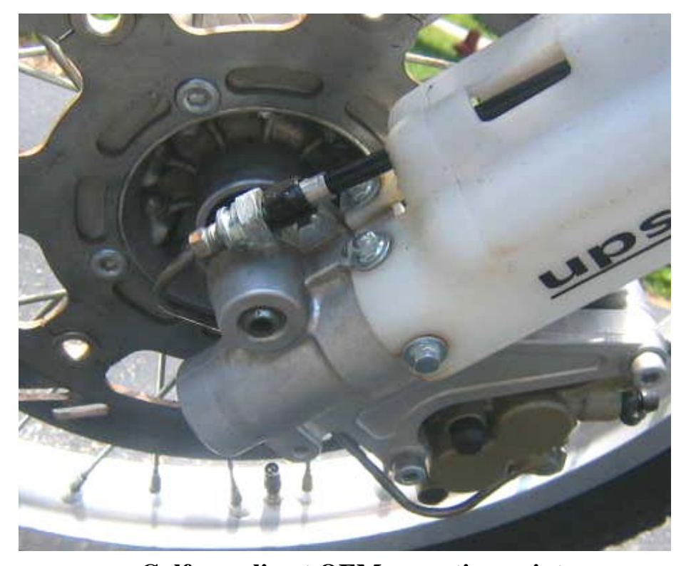
c. Galfer c-clip at OEM mounting point