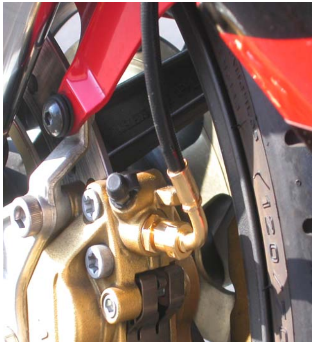
c. Left caliper

GALFER USA 310 IRVING DRIVE OXNARD, CA 93030 PH (805) 988-2900 . FAX (800) 685-6633 WWW.GALFERUSA.COM