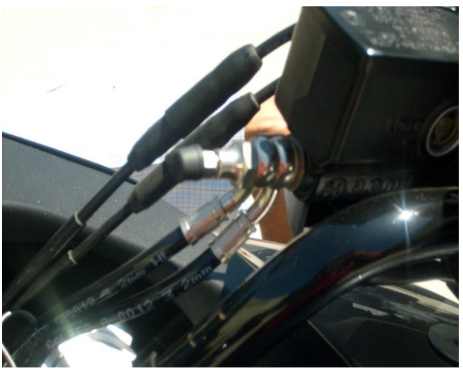
a. Front master cylinder