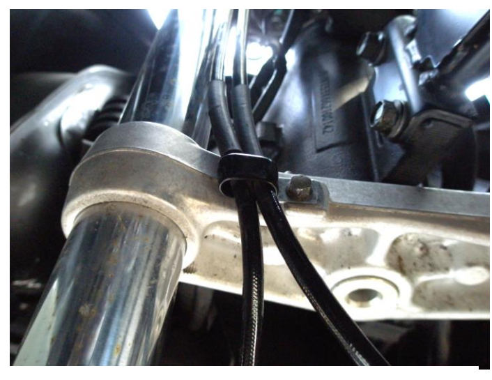
b. Galfer c-clip at lower triple tree