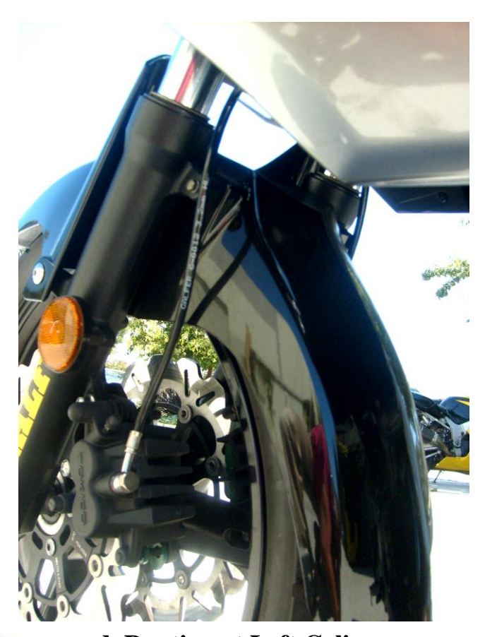
d. Routing at Left Caliper

GALFER USA 310 IRVING DRIVE OXNARD, CA 93030 PH (805) 988-2900 . FAX (800) 685-6633 WWW.GALFERUSA.COM