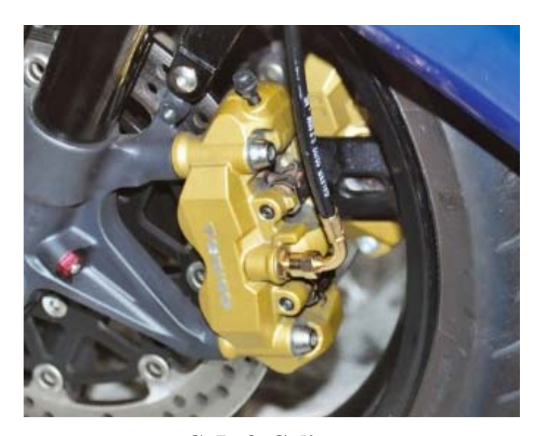
C. Left Caliper