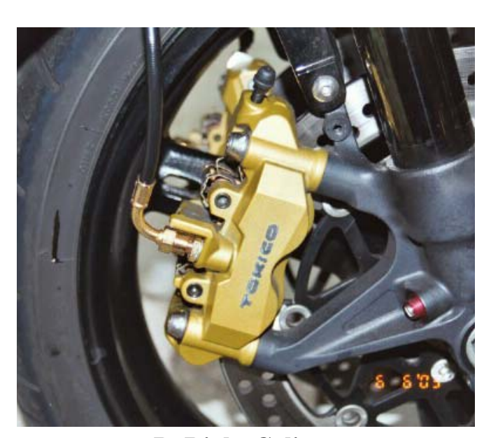
B. Right Caliper