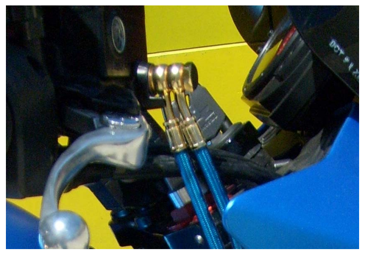
a. Front master cylinder