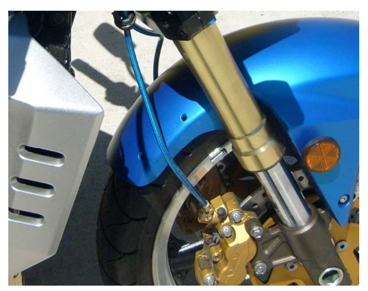
c. Right line at right caliper