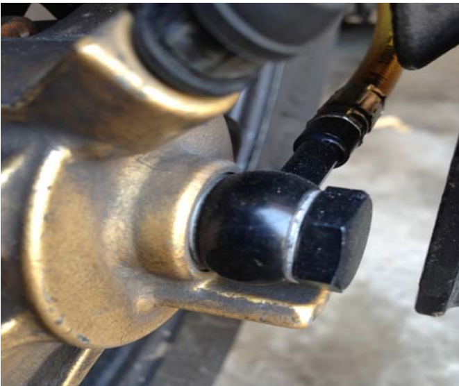
C. Rear Caliper