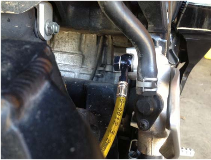
A. Rear Master Cylinder