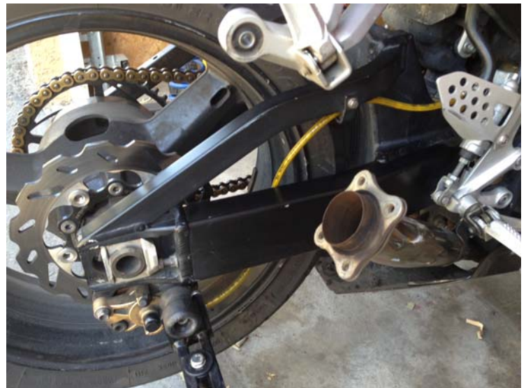
D. Overall Line Routing

GALFER USA 310 IRVING DRIVE OXNARD, CA 93030 PH (805) 988-2900 . FAX (805) 988-2948 WWW.GALFERUSA.COM