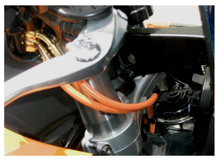
b. Routing from master cylinder to lower triple tree