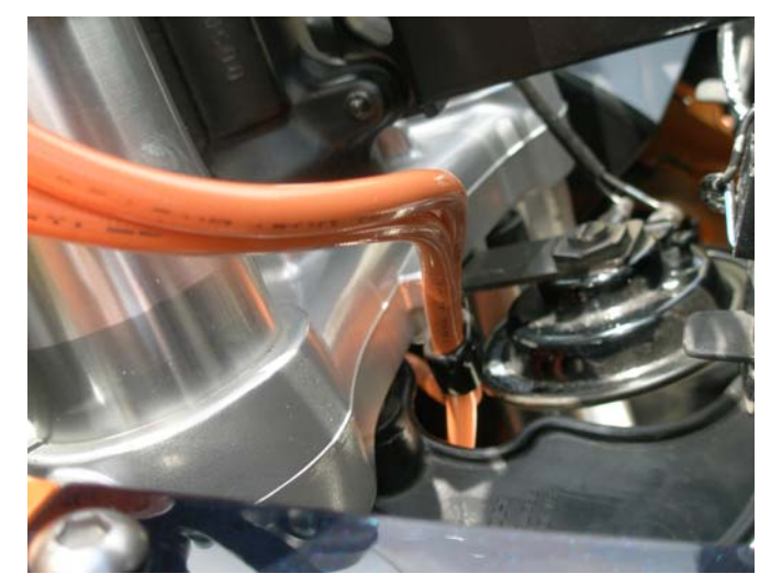
c. Routing at lower triple tree