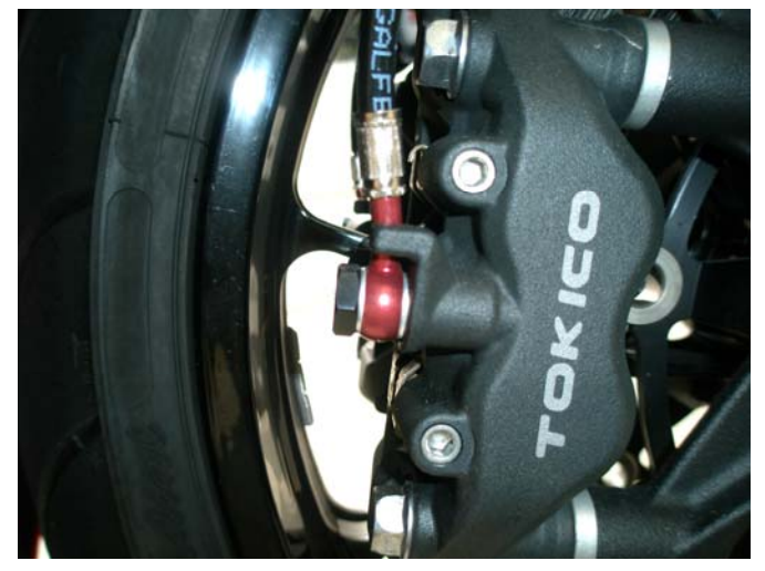
g. Right caliper, notice sequence