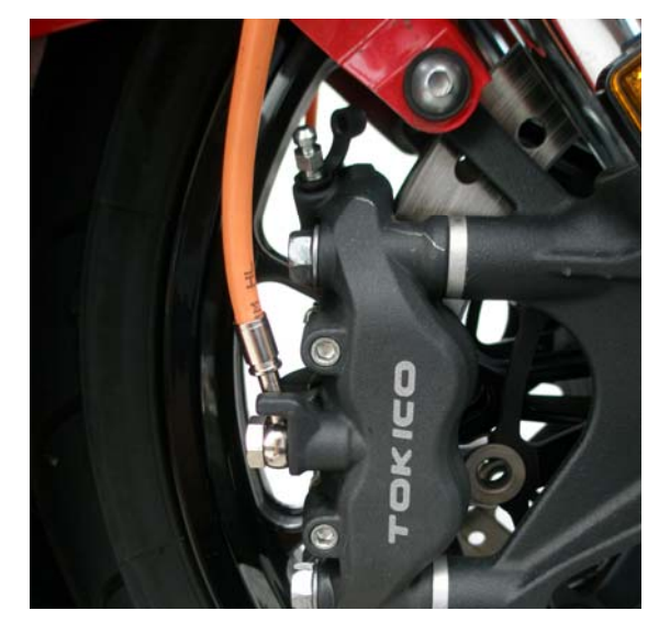
f. Right caliper