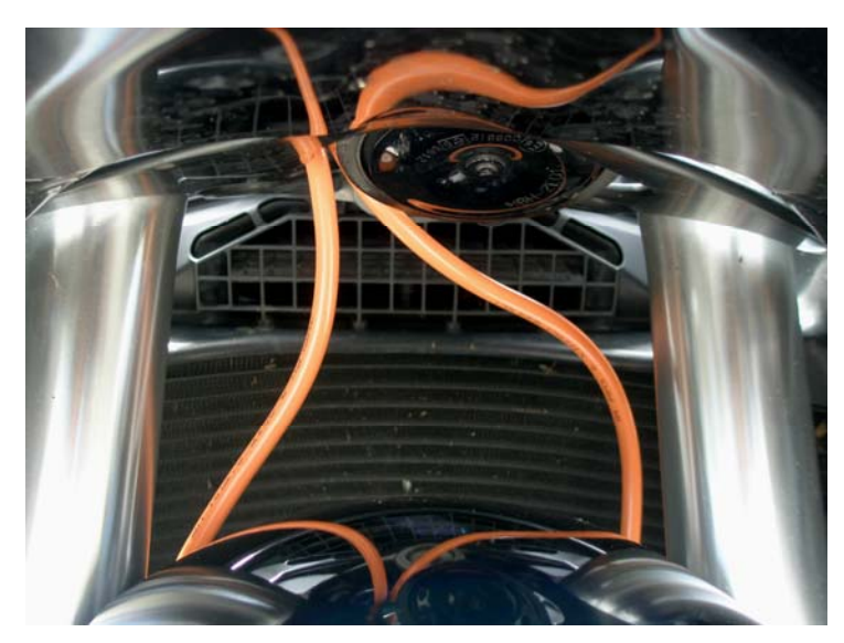
e. Routing behind forks