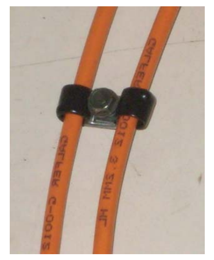
b. Galfer c-clips