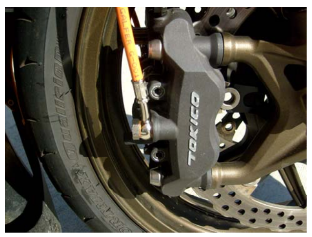
e. Right caliper