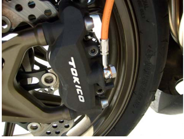
f. Left caliper

GALFER USA 310 IRVING DRIVE OXNARD, CA 93030 . PH (805) 988-2900 . FAX (800) 685-6633 WWW.GALFERUSA.COM