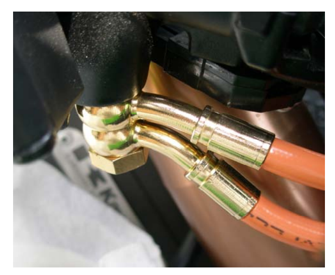
a. Front master cylinder