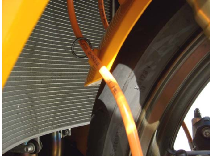
d. Galfer line routed through OEM holder at fender