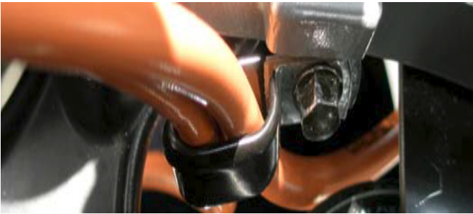
A4 (TRIPLE C-CLIP)