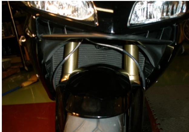
A5 (FRONT VIEW) LINES ROUTE IN FRONT OF FORKS