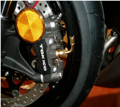
A7 (LEFT CALIPER )