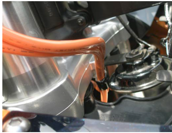
A2 (MASTER CYLINDER)