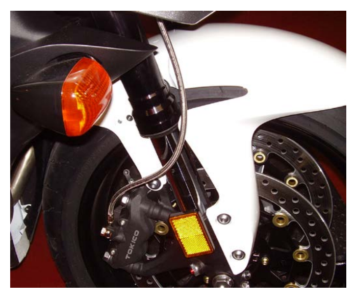
D. Line Routed in Front of the Fork to the Right Caliper