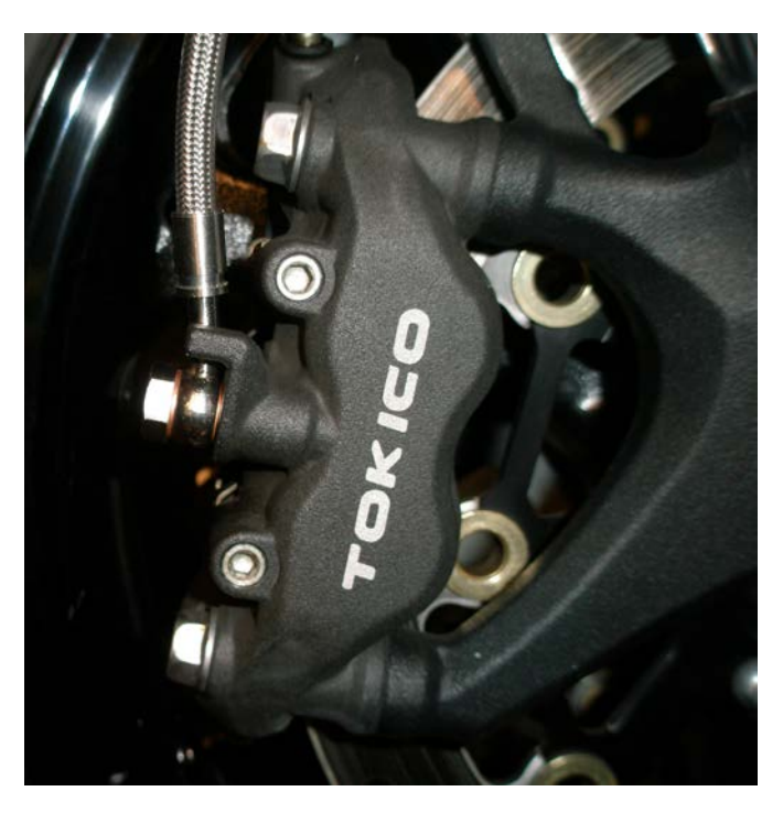
F. Right Caliper