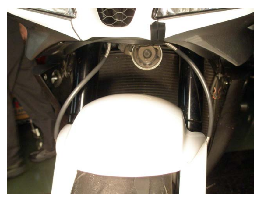
C. Lines Routed in Front the of Forks