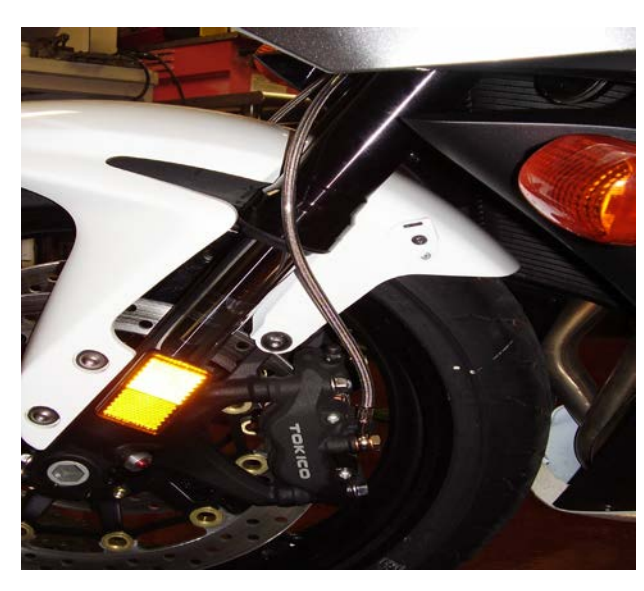
E. Line Routed in Front of the Fork to the Left Caliper