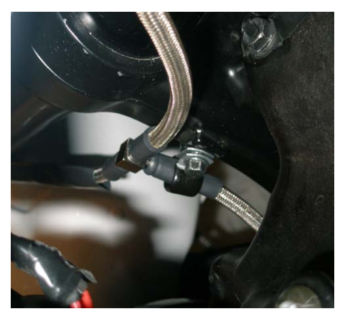
B. Left Line of the T-block secured by the Galfer C-Clip at Triple Tree