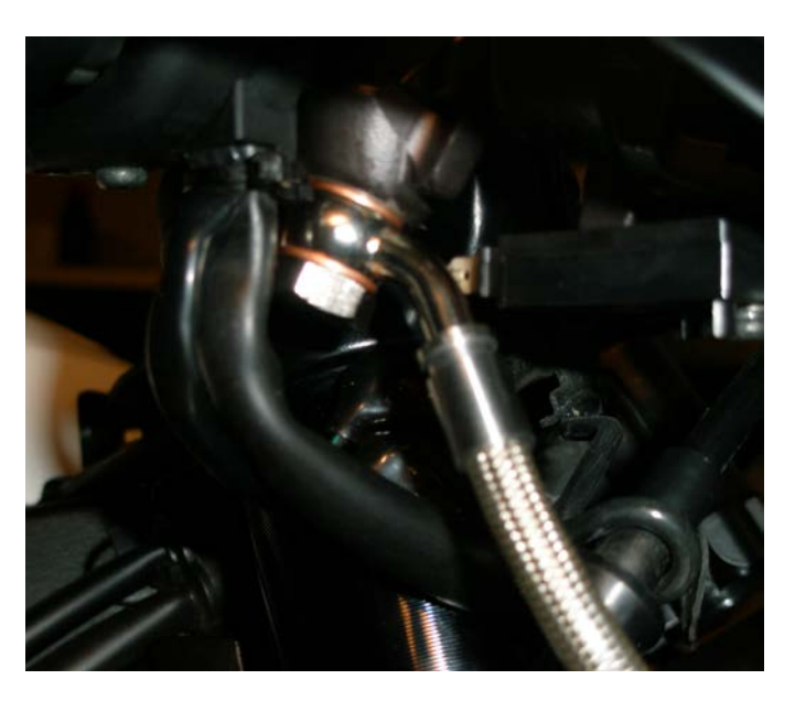
A. Master Cylinder