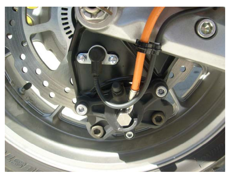
c. Rear caliper