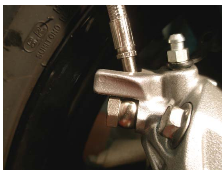
D. Right Caliper