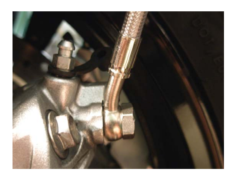
C. Left Caliper