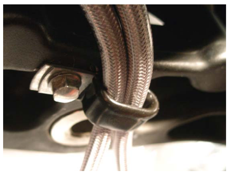
B. Galfer C-Clip at the Lower Triple Tree