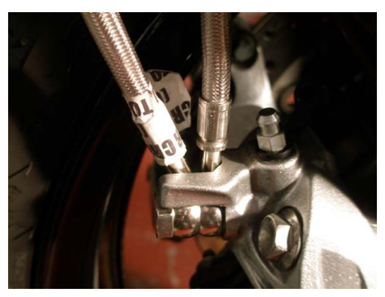
C. Right Caliper with Master Cylinder line and Crossover Line installed