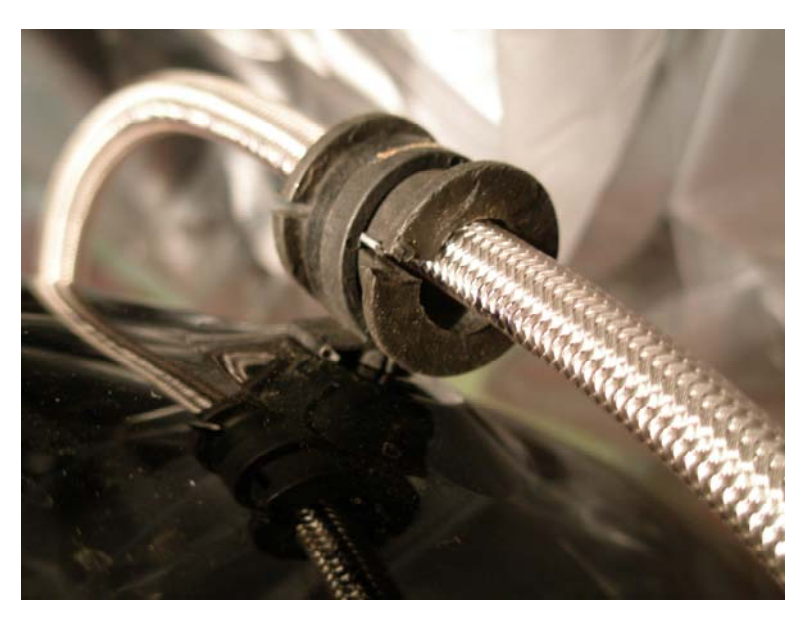
D. Galfer Crossover Line at the Front Fender OEM Line Holder