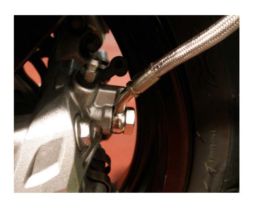
E. Left Caliper

GALFER USA 310 IRVING DRIVE OXNARD, CA 93030 PH (805) 988-2900 . FAX (805) 988-2948 WWW.GALFERUSA.COM