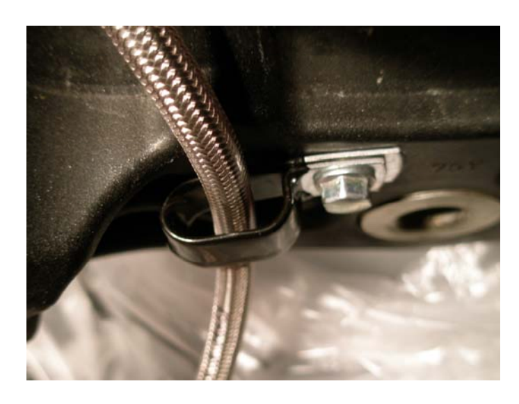
B. Galfer C-Clip at the Lower Triple Tree