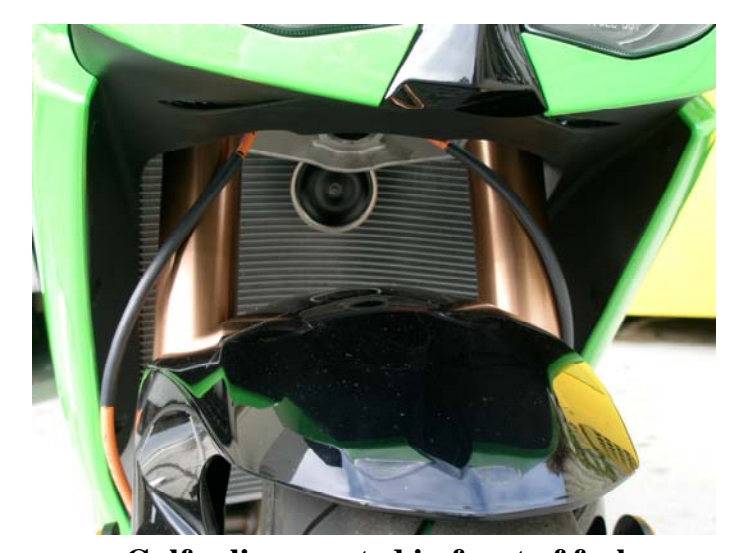
c. Galfer lines routed in front of forks