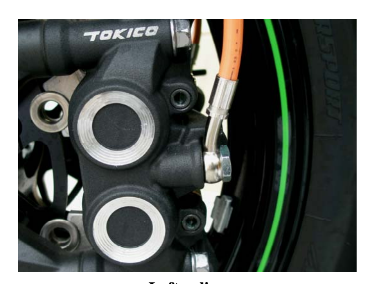
e. Left caliper

GALFER USA 310 IRVING DRIVE OXNARD, CA 93030 . PH (805) 988-2900 . FAX (800) 685-6633 WWW.GALFERUSA.COM