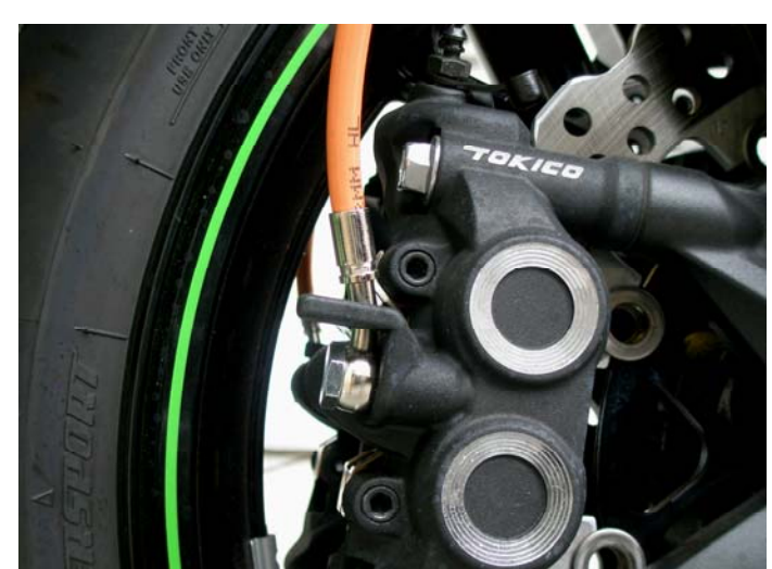
d. Right caliper