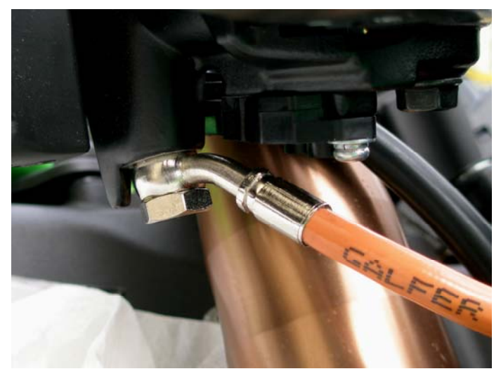
a. Front master cylinder