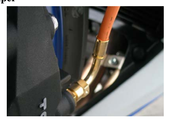
e. Left caliper, notice position of fitting