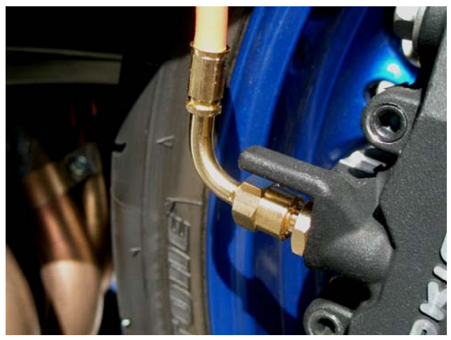
c. Right caliper