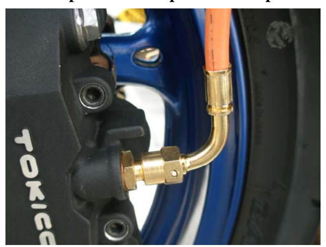
d. Left caliper