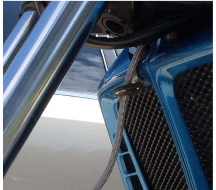
B. OEM Line holder at Radiator Trim