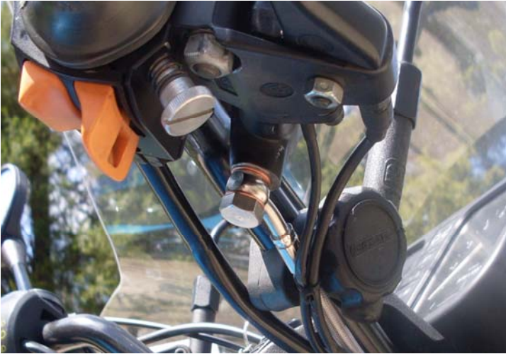
A. Front Master Cylinder