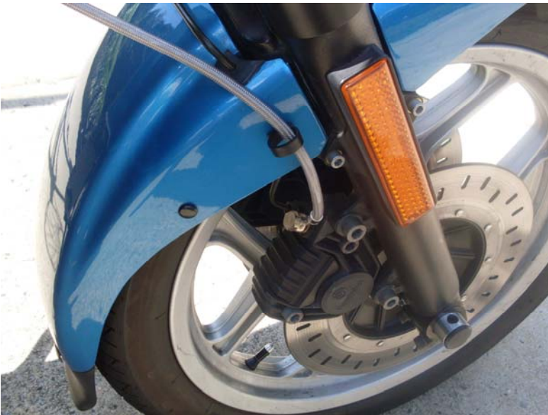
C. OEM Line Holder at fender and Right Caliper