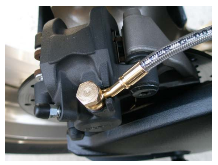
D. Rear caliper

GALFER USA 310 IRVING DRIVE OXNARD, CA 93030 PH (805) 988-2900 . FAX (800) 685-6633 WWW.GALFERUSA.COM