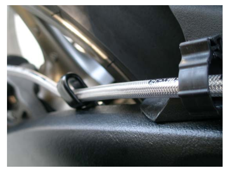
C. Galfer c-clip at swing arm