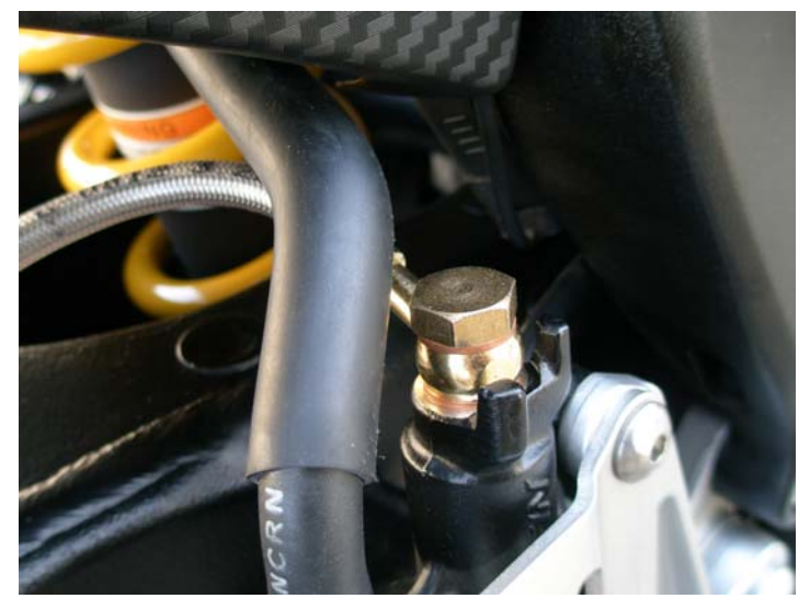
A. Rear master cylinder, notice position of fitting