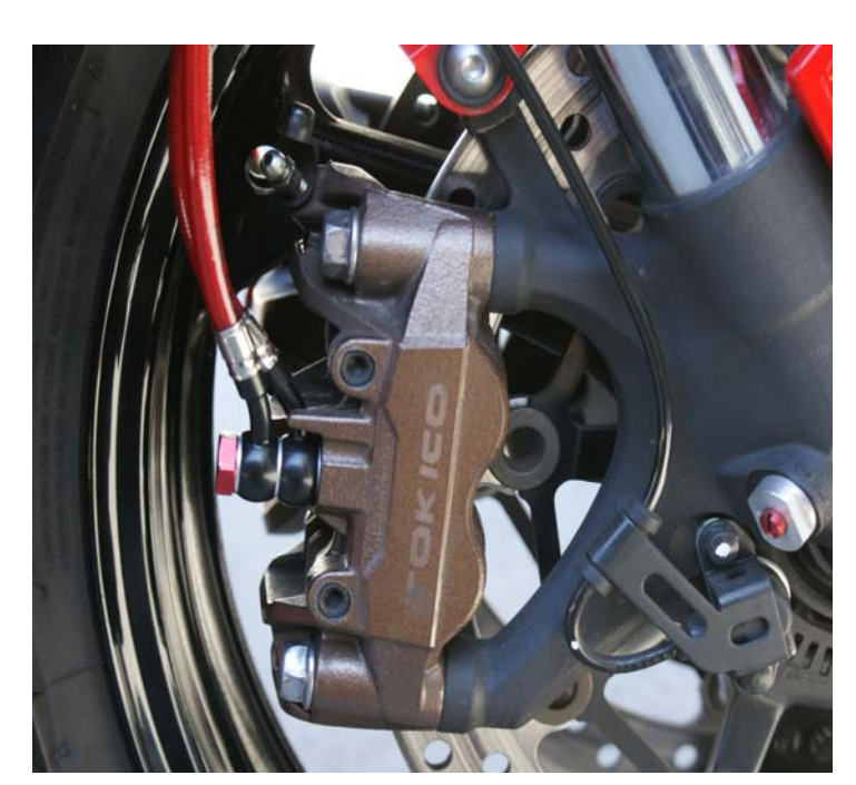
E. Lines C & B at Right Caliper