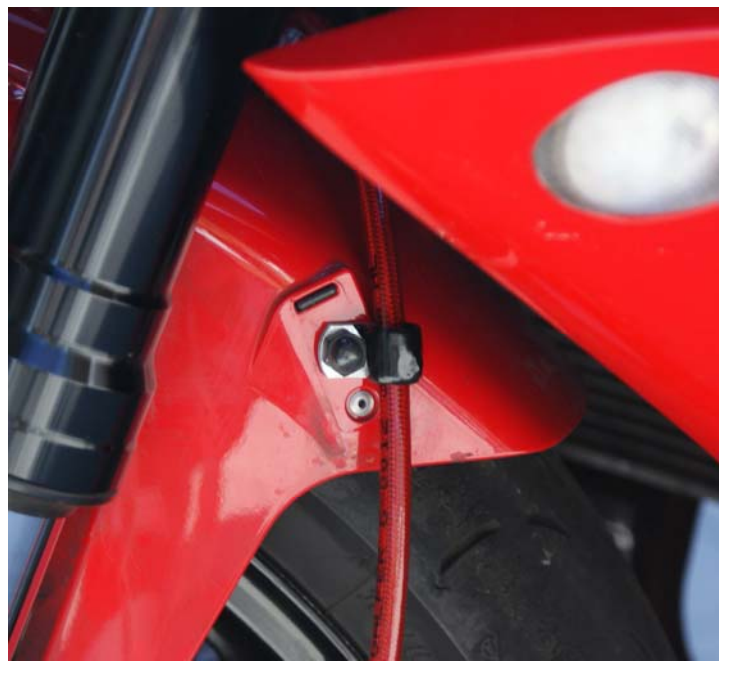
G. Line B at Galfer C-Clip on Left side of fender