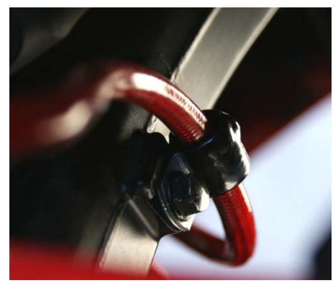
B. Galfer C-Clip at Lower Triple Tree