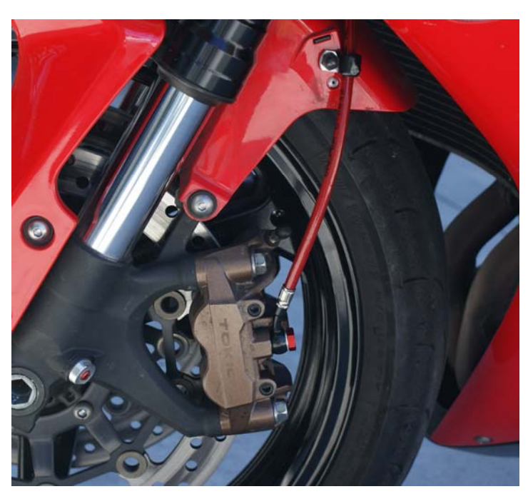
H. Line B at Left Caliper