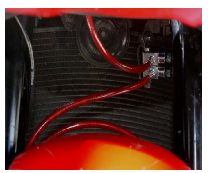
I. Overall Line Routing