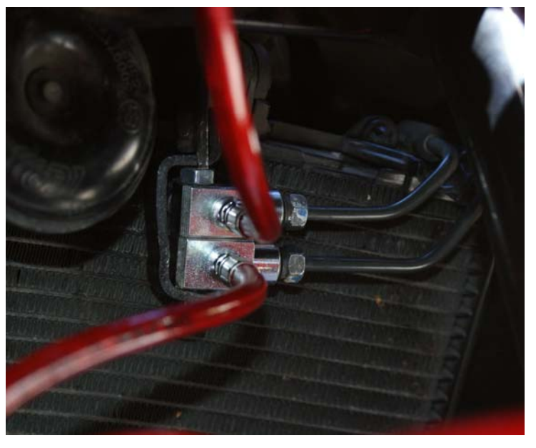
C. Line A and Line C 90° Union at OEM tubing