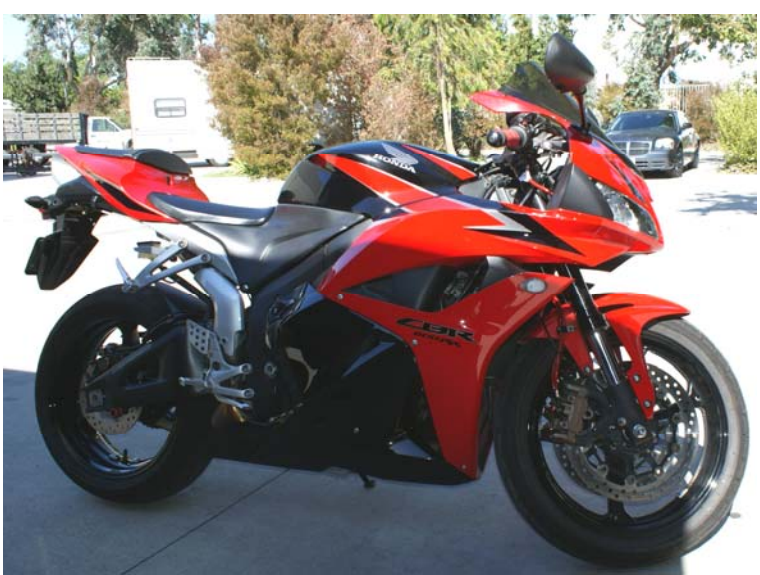
J. Bike Overall

GALFER USA 310 IRVING DRIVE OXNARD, CA 93030 PH (805) 988-2900 . FAX (805) 988-2948 WWW.GALFERUSA.COM