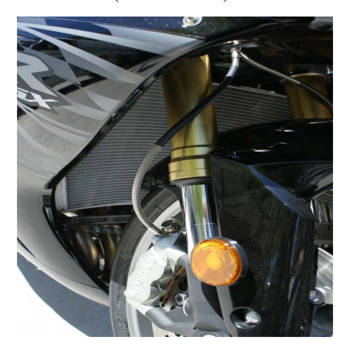
A6 (RIGHT CALIPER)