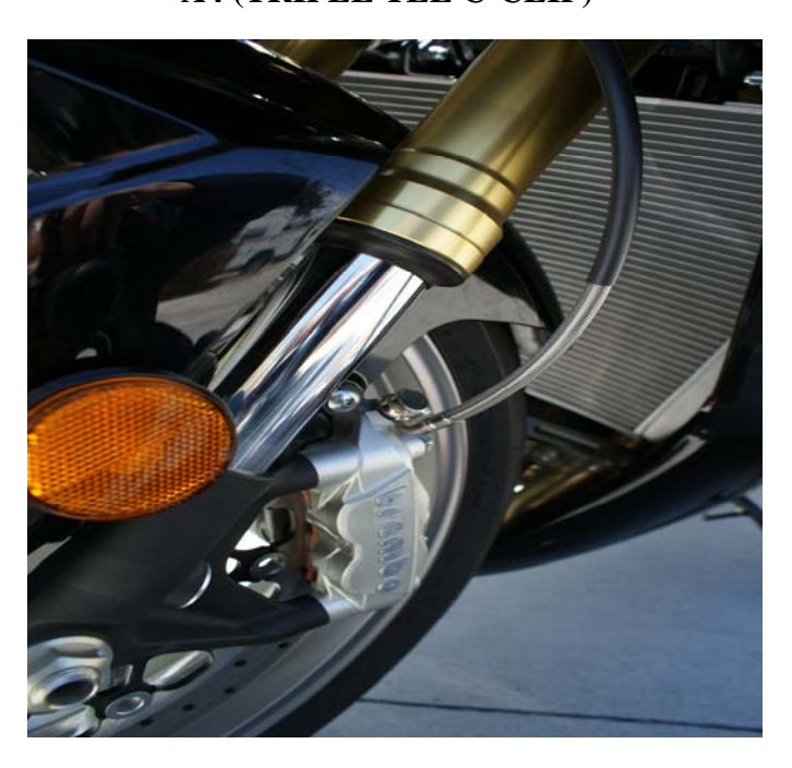
A7 (LEFT CALIPER)

(800) 685-6633 310 Irving Drive Oxnard, California 93030