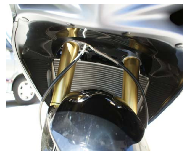
A3 (FRONT VIEW)