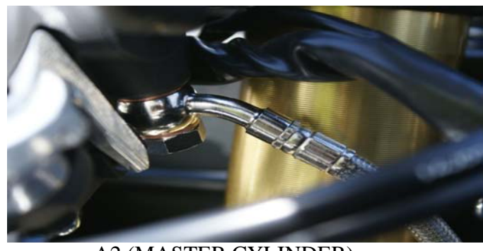
A2 (MASTER CYLINDER)