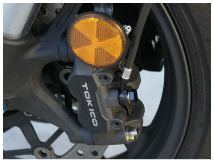
C. Left Caliper