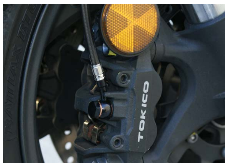
D. Right Caliper