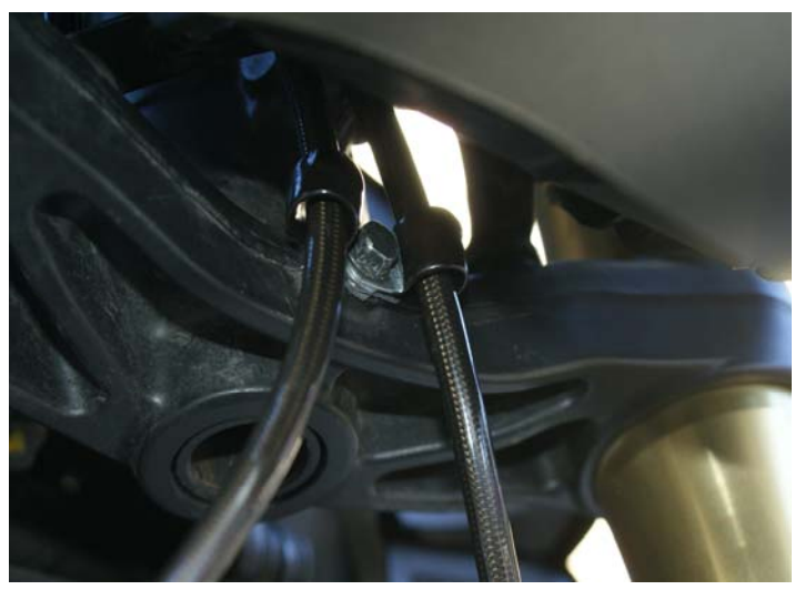
B. Galfer Lines in C-Clips at Triple Tree