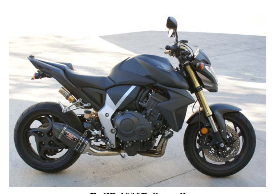
F. CB 1000R Overall

GALFER USA 310 IRVING DRIVE OXNARD, CA 93030 PH (805) 988-2900 . FAX (805) 988-2948 WWW.GALFERUSA.COM