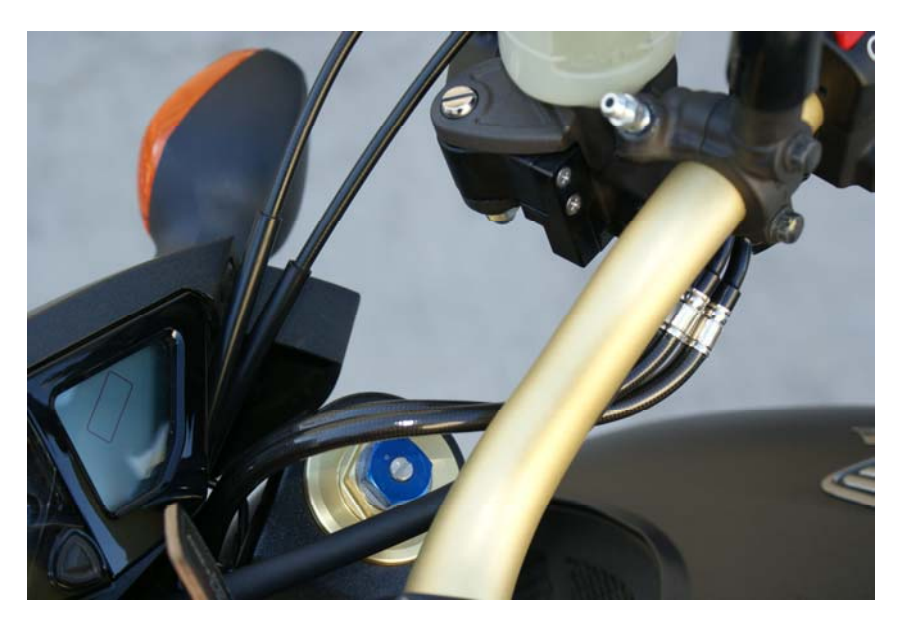
E. Lines routing from Master Cylinder down through stock guide bracket