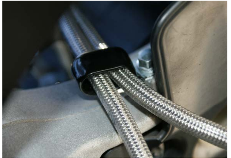
B. Galfer C-Clip at Triple Tree