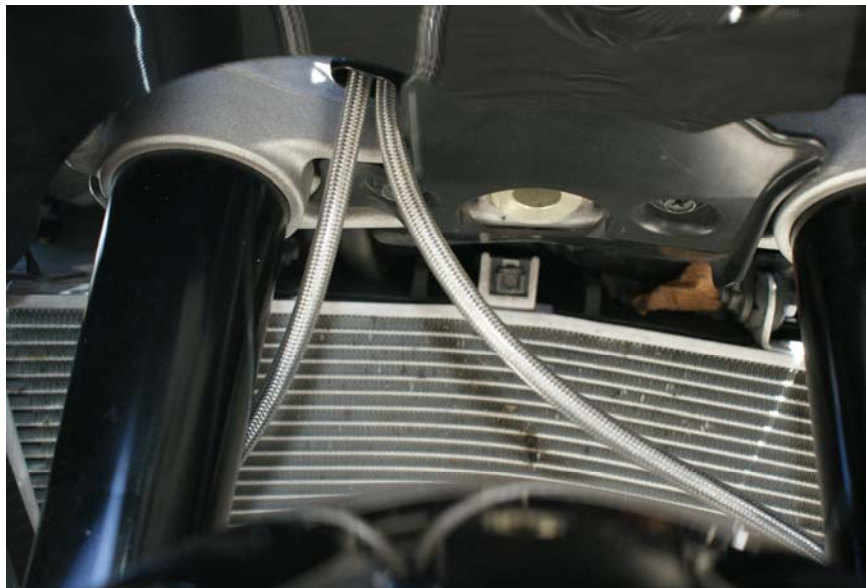
C. Galfer lines routing behind the forks