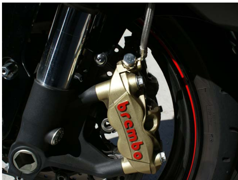
E. Left Caliper

GALFER USA 310 IRVING DRIVE OXNARD, CA 93030 PH (805) 988-2900 . FAX (805) 988-2948 WWW.GALFERUSA.COM