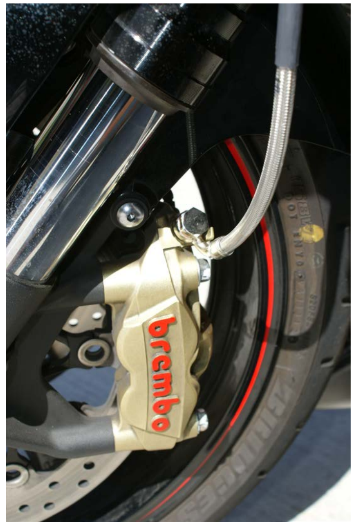
F. Left Caliper