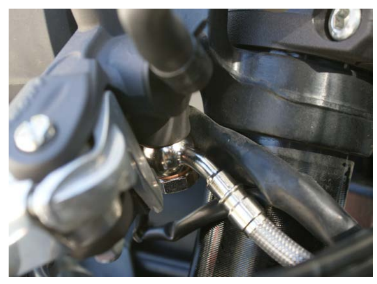
A. Master Cylinder