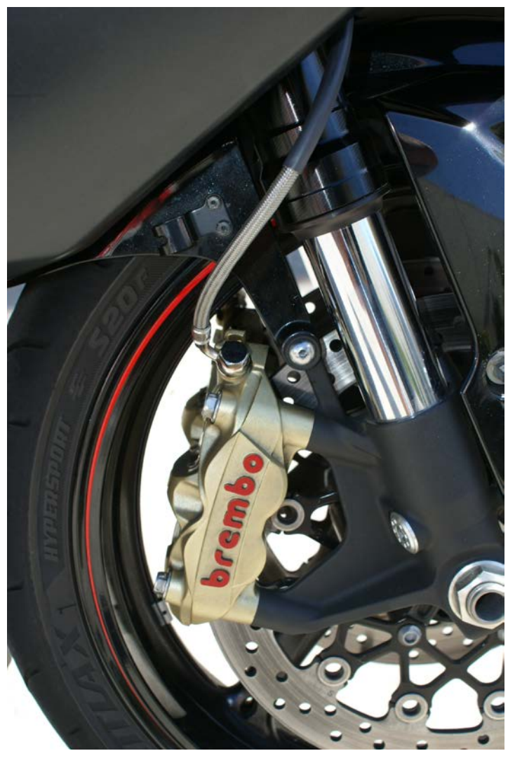
E. Right Caliper