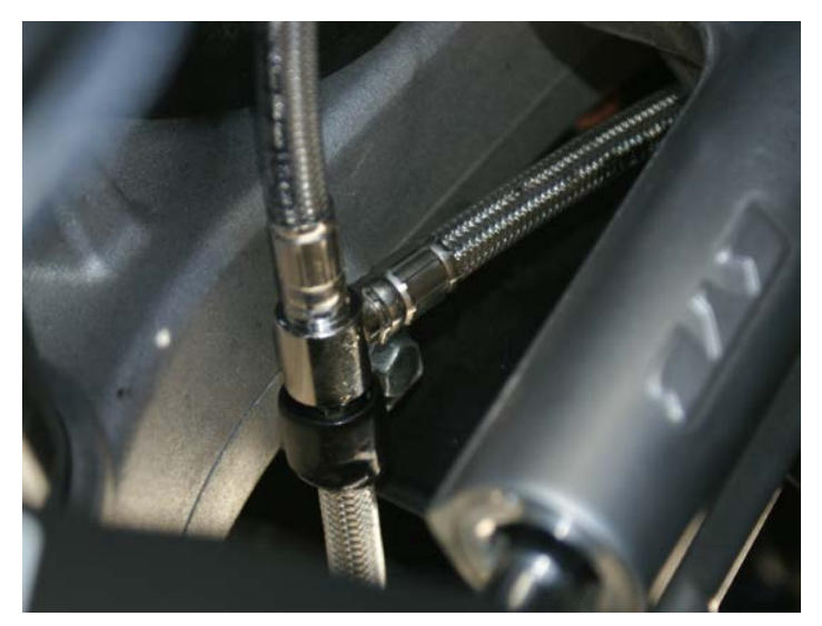
B. Galfer C-Clip at Triple Tree