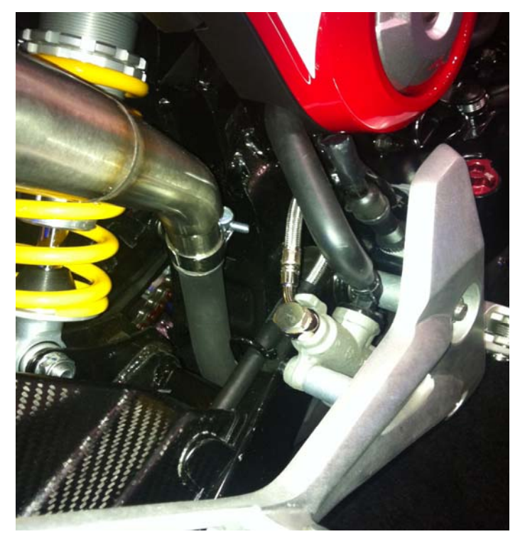
A. Rear Master Cylinder