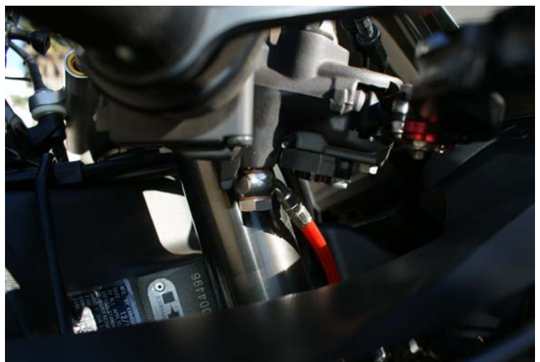
A. Master Cylinder

Please be aware that the overall braking feel has been changed dramatically. We suggest taking it easy while you get used to the new brake lever pressure and feel. We recommend checking your brake system periodically; be sure to check that your bolts are tight and VERY carefully check your lines for any leaks or damage. If there are any signs of damage or stress to the lines, the complete brake line kit will need to be replaced. Remember, our brake lines have a LIFETIME WARRANTY! If you have any problems or questions, do not hesitate to call our tech department - (800) 685-6633 .