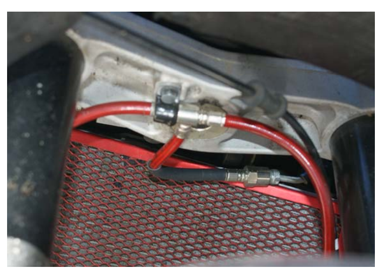
E. Galfer Line at OEM Hard Tubing and Galfer C-Clip at Lower Triple Tree