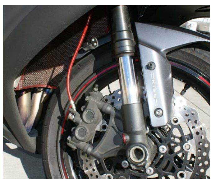
F. Right Caliper