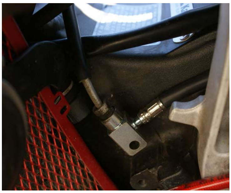
C. Master Cylinder Line at Right OEM Hard Tubing.