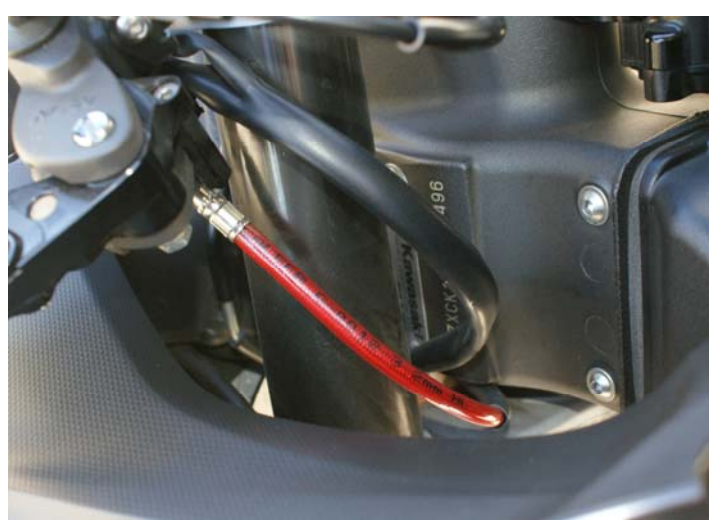
B. Master Cylinder Line Routing