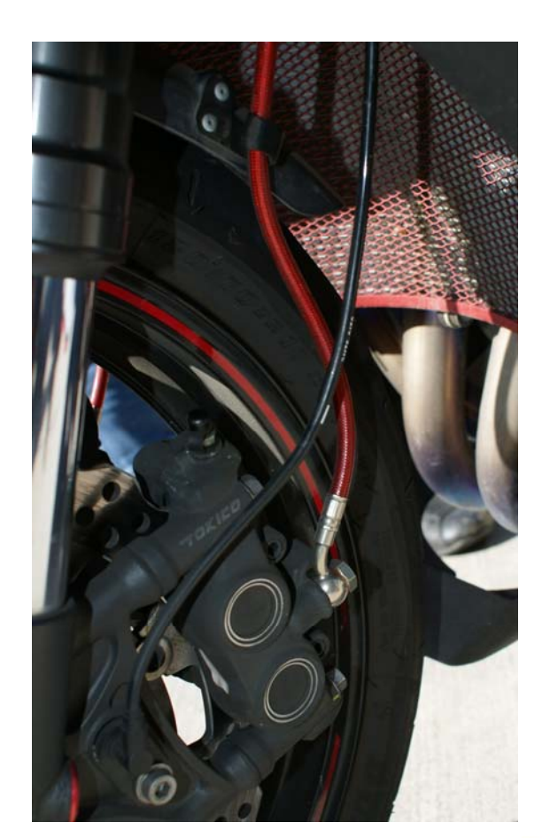
G. Left Caliper