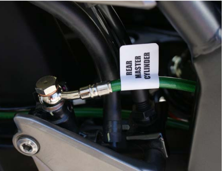
H. Line C at Rear Master Cylinder