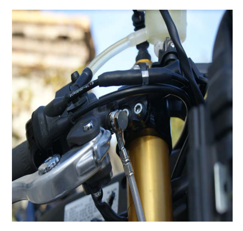
Front master cylinder Line-A

Please be aware that the overall braking feel has been changed dramatically. We suggest taking it easy while you get used to the new brake lever pressure and feel. We recommend checking your brake system periodically; be sure to check that your bolts are tight and VERY carefully check your lines for any leaks or damage. If there are any signs of damage or stress to the lines, the complete brake line kit will need to be replaced. Remember, our brake lines have a LIFETIME WARRANTY! If you have any problems or questions, do not hesitate to call our tech department - (800) 685-6633 .