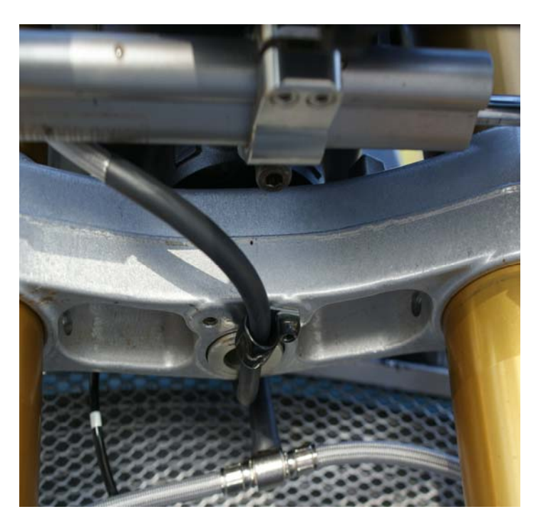
Line-A routing lower triple using