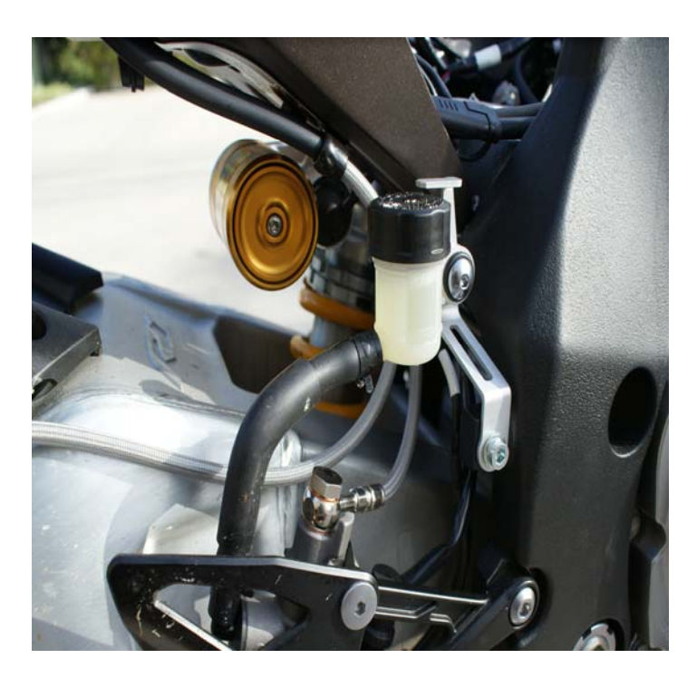
Rear Master Cylinder Line-E