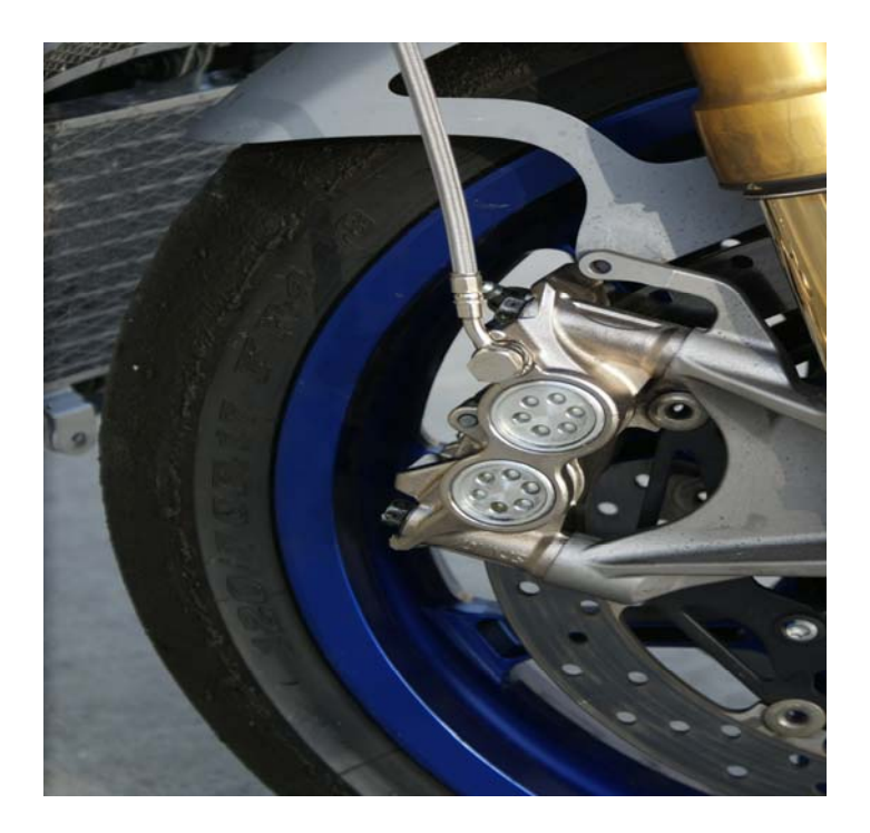
Front right caliper Line-B