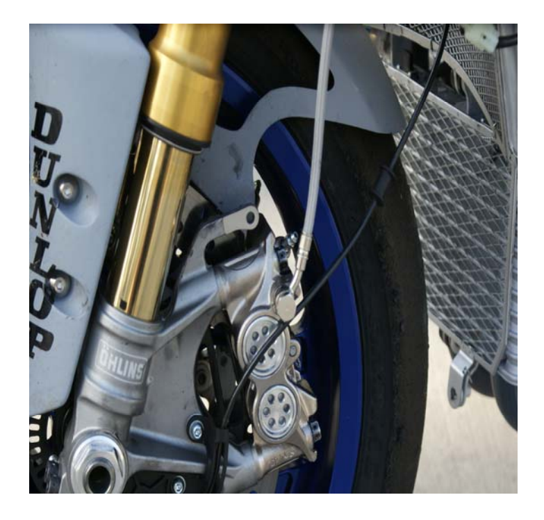
Front left caliper Line-C