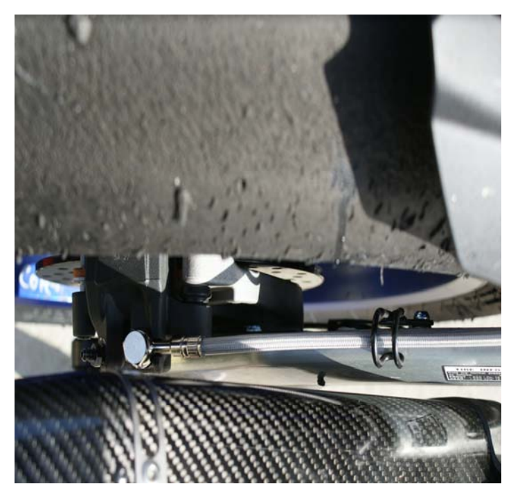
Rear Caliper Line-F