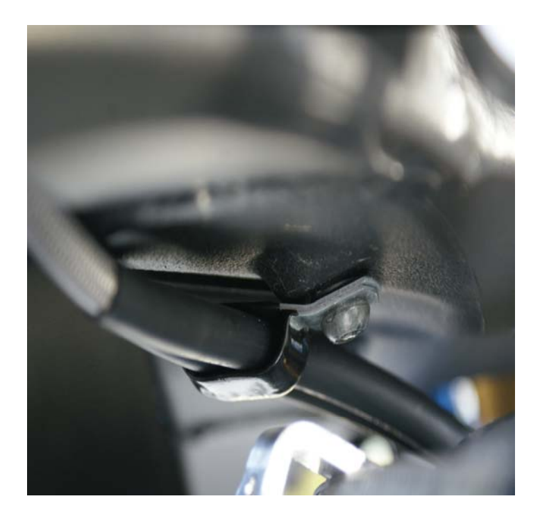
Clip-2 Line-A-D lower neck frame