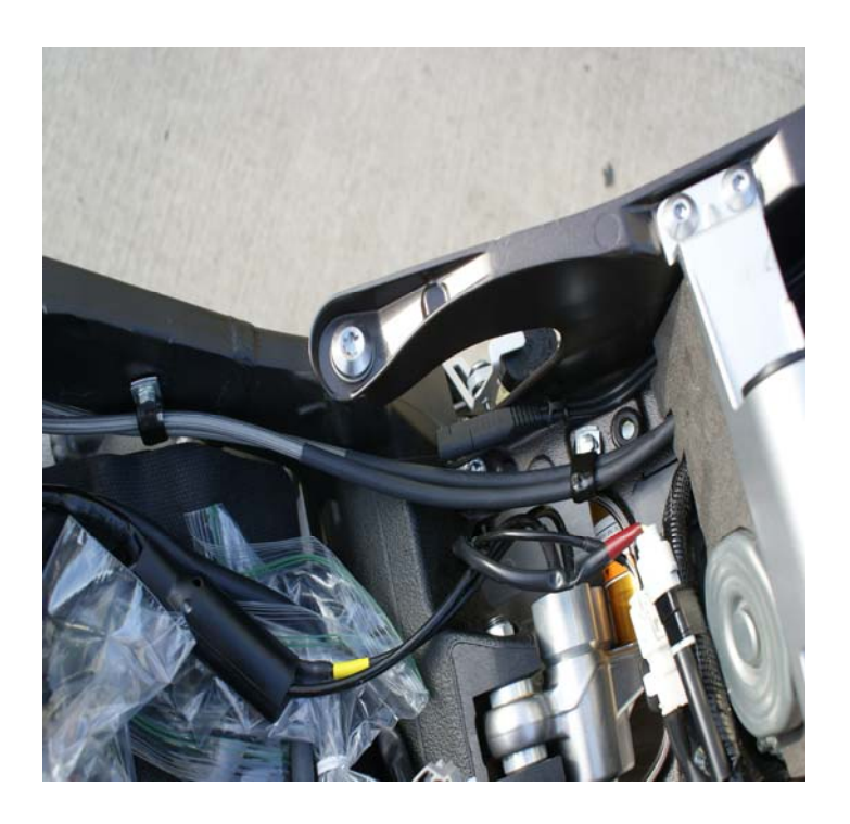
Line-A-D right frame routing to ABS Unit