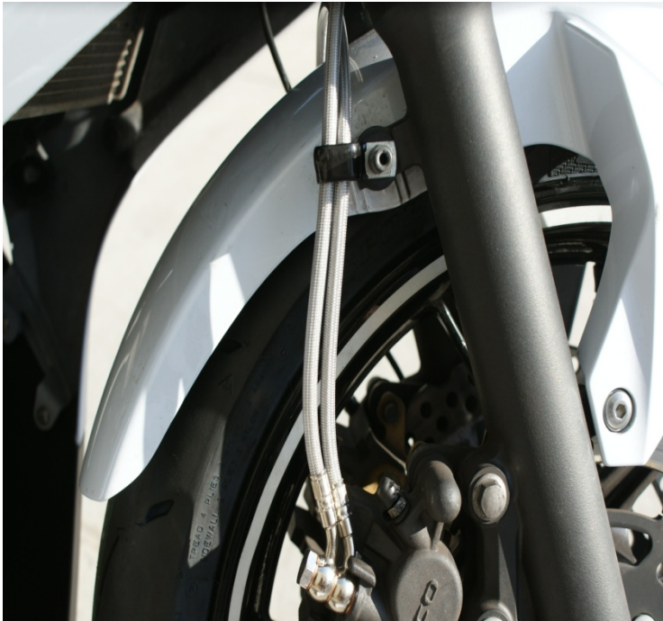
LINE- B / C RIGHT