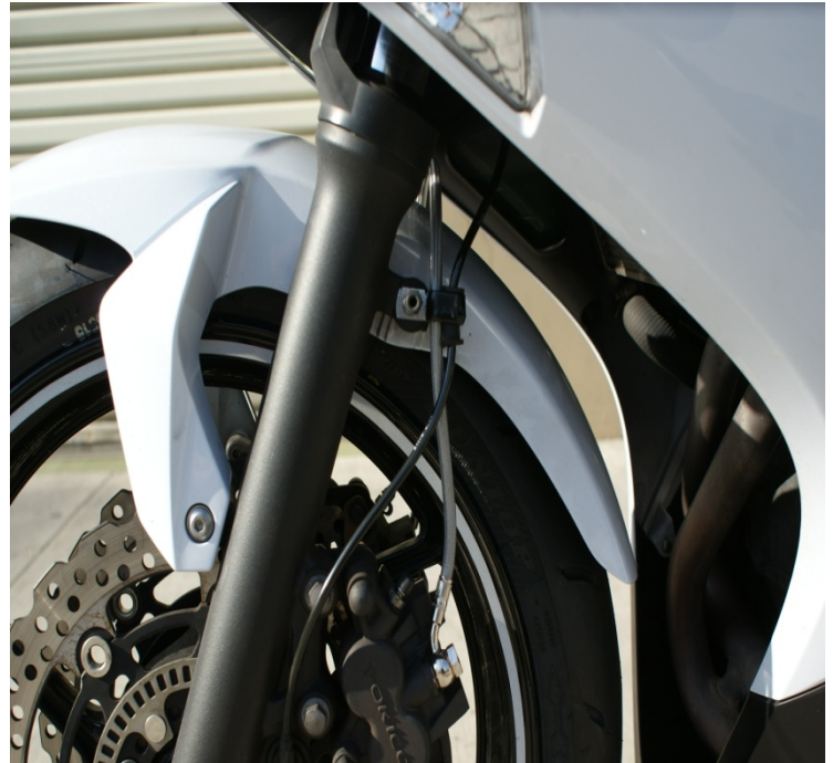
LINE-C LEFT CALIPER