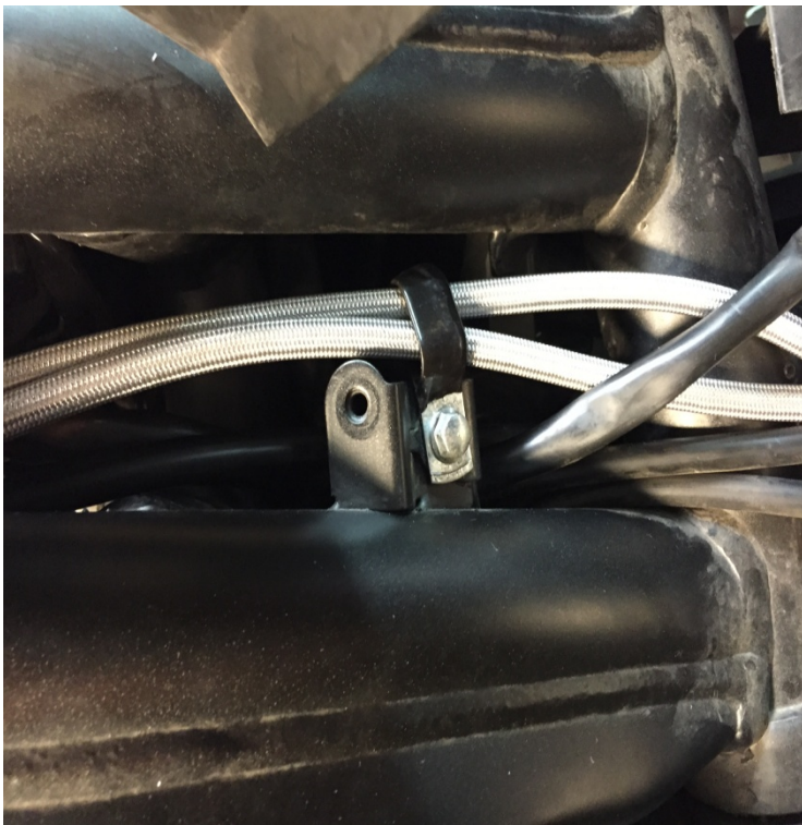
LINE-B & A