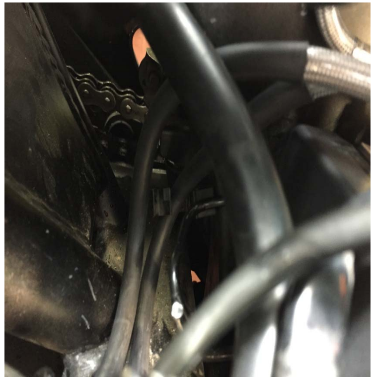
LINE-D / E